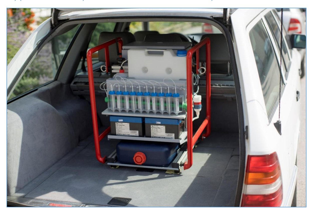
FIGURE 1: ERU (COLIMINDER EMERGENCY RESPONSE UNIT) IN A CAR