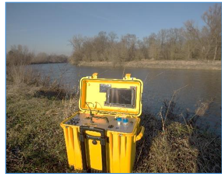
FIGURE 2 (FROM LEFT): ERU FRONT SIDE | ERU REVERSE SIDE | COLIMINDER MOBILE FOR SCIENTIFIC USE IN REMOTE AREAS